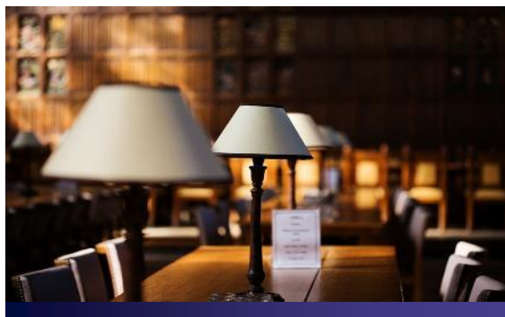
“A good cost assessment should lead to an accurate estimate of the efficient cost level...”

In PR14, Ofwat ultimately required companies to submit evidence that their costs would be subject to input price inflation and provide inflation forecasts. Companies in the upper quartile of efficiency according to Ofwat’s unit cost models and that also met other criteria, were set a cost allowance that took account of input price inflation. The sum is fixed and does not depend on outturn input price inflation and therefore they bear input price inflation risk.